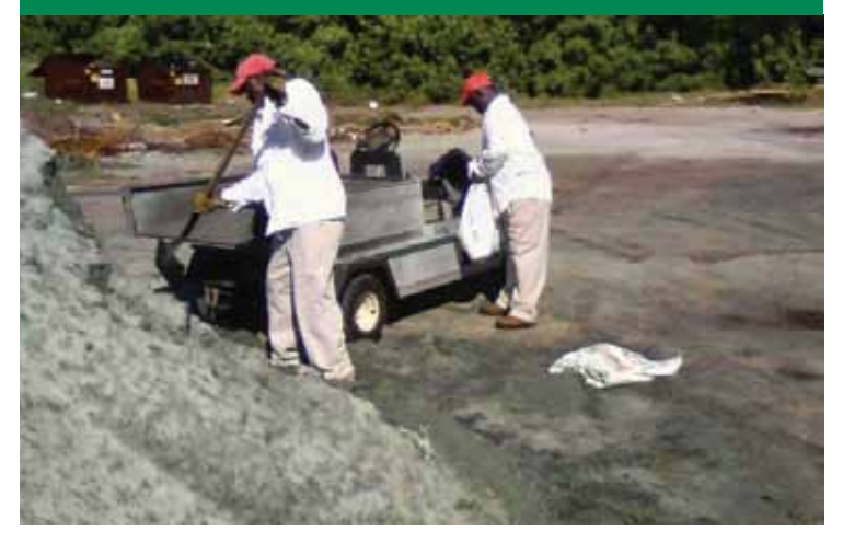
Green dyed sand being mixed with Milorganite (approximately 80/20) on the bed of the utility cart to make up sand for filling in fairway divots.

FILLING FAIRWAY DIVOTS. Milorganite is added to sand (sometimes stained green) for use in filling fairway divots to improve turfgrass recovery.