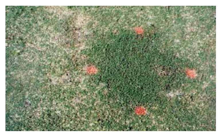
Milorganite was topdressed with sand within the square delineated by the orange dots.

TOPDRESSING FOLLOWING CULTIVATION. Milorganite mixed with topdressing sand at the rate of 10 or more pounds per cubic yard of sand will speed recovery from core aerifications or verticutting. The low-salt property of Milorganite makes it preferable to chemical fertilizers which may stress grass that already is damaged by the aerification, and Milorganite fortifies the sand topdressing with organic matter.