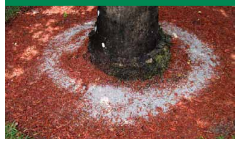
Limestone ring residue following application of a fertilizer containing limestone filler